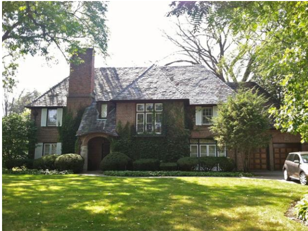
1038 Bluff Road – DEMOLITION PENDING

*House advertised as rehab or teardown *HPC sent letter to realtor, 11/20/15 *HPC sent letter to Bayit Builders, 12/22/16 *Builder declined to meet with HPC