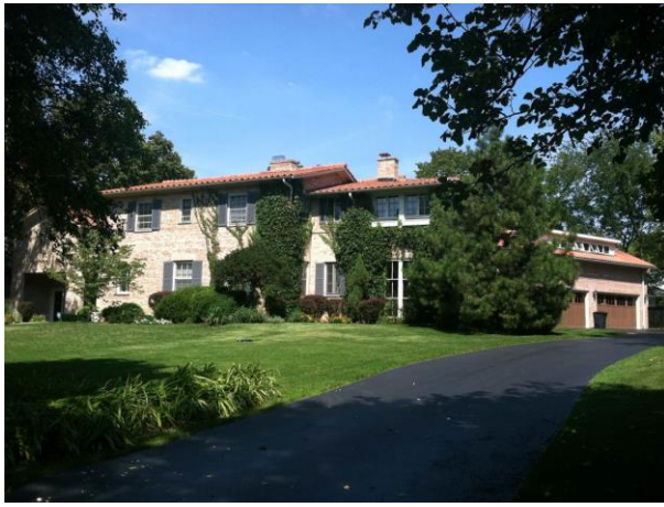
803 Bluff Street – DEMOLISHED 10/20/16

*Alterations/additions not sensitive to original design * HPC took no further action given condition