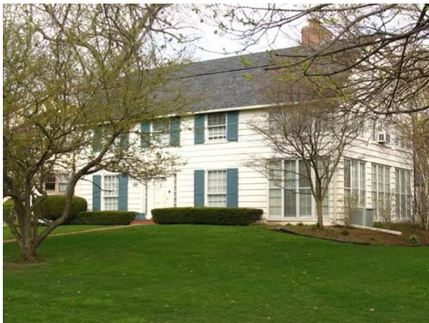
241 Fairview Road – DEMOLISHED 12/27/16

*House advertised as teardown *HPC sent letter to realtor, 3/16/16 *HPC sent letter to Bayit Builders, 12/22/16 *Builder declined to meet with HPC