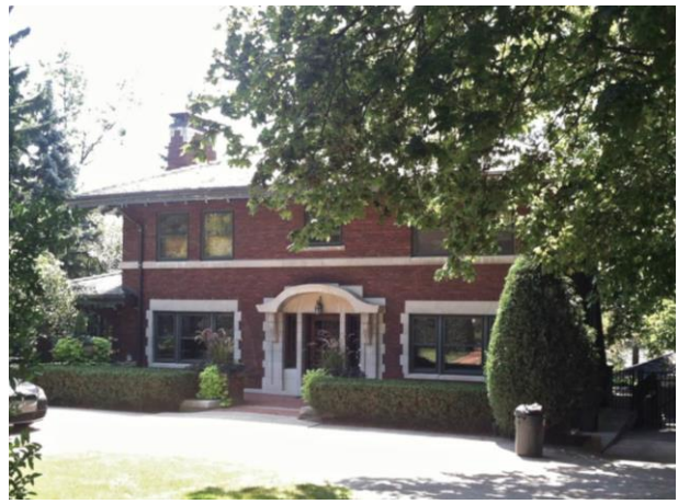
854 Bluff Street – DEMOLITION PENDING

*Alterations/additions not sensitive to original design * HPC took no further action given condition