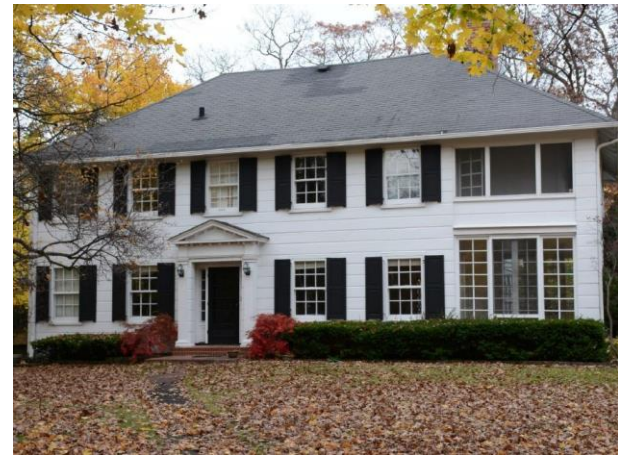
1017 Forest Avenue – DEMOLISHED 10/31/16

*House interior gutted to studs by previous owner *For sale “as-is”; architectural integrity compromised *HPC took no further action given condition