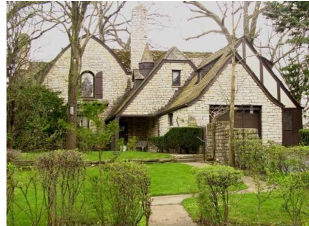
190 Fairview Road – DEMOLITION PENDING

*House sold directly to builder; not advertised *HPC sent letter to Highgate Builders, 4/28/16 *HPC met with Jon Kogan of H.B., 5/3/16